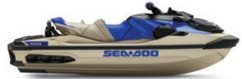
● Sand and Dazzling Blue